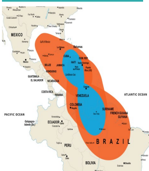
Shine AM800 coverage map (Orange is new coverage after powerup in 2018)