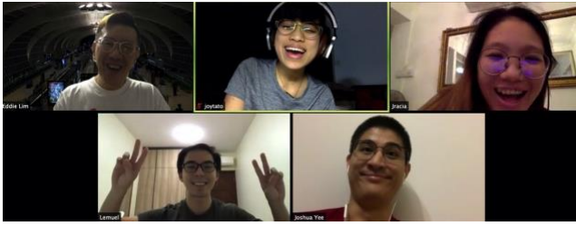
Route 1 – prayers & updates

This is a small group of regulars at Route 1 where we cover Lorong 24, 22 and 20.