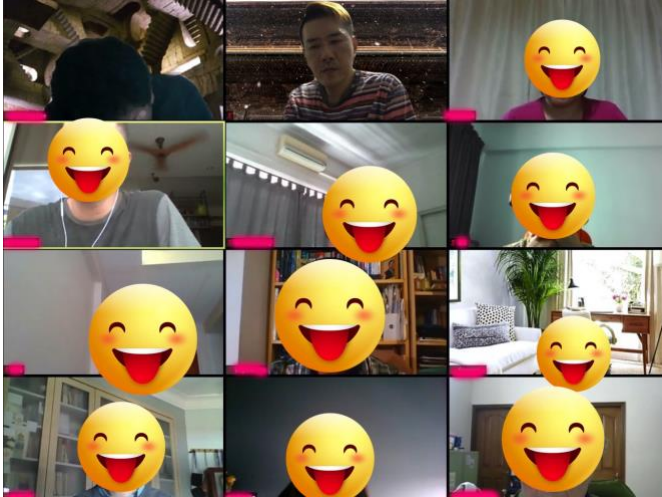
TWR Office Zoom – devotions & prayers

Weekly TWR office meets online on Tuesdays for devotion and prayers and also a casual session on Friday to chat. We shared how we came to faith on Friday and we know each other better from these sessions.