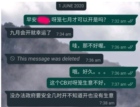
One of my conversations with an uncle [my text in green]

There is some ongoing work to help some ladies despite the Circuit Breaker following Phase 1.