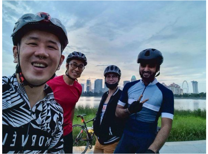
Cycling Around Singapore (East)

Long story short, I took over a Meetup Group which is due to close if no one takes up leadership. I took it up and trust it will be a good way to be a Christian influence.