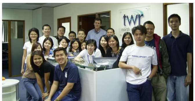
circa 2015, in High Street office where I started

Though I do not make a killing with a fat pay check, the opportunity to work in Christian media and making a difference to our audience on air and online is rewarding.