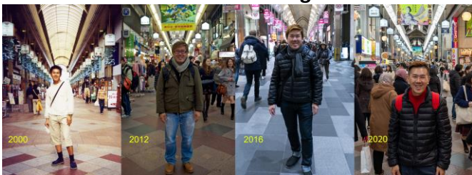
2000, 2012, 2016, 2020, Teramachi, Kyoto, Japan