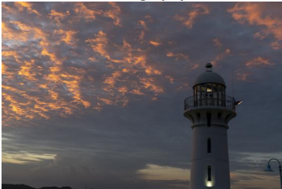
Raffles Marina on Pie Day, 2020 03 14

It is hard to bring up the gospel or hand out a tract without any prior contact or friendship. There are times I was rejected when I offer my photo postcards. I had the right attitude, heart but not the approach.