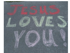
Just a couple of chalk creations on the drive.