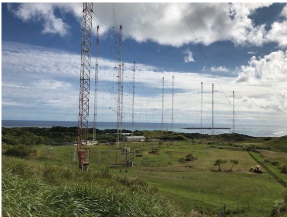
TWR's Antenna Field in Merizo, Guam.

Guam has been broadcasting the gospel via shortwave transmitters for over 40 years. In Guam I