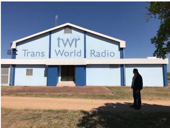
This is a photo of TWR's transmission site in Eswatini.

I am sitting in TWR's office near Johannesburg, South Africa as I sit to write this letter to you. Last week, another IT member and I traveled to TWR's office in Eswatini. Next week we plan to travel to TWR's office in KwaZulu-Natal. It's my first trip to the continent of Africa.