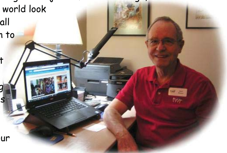
Ready for our first virtual career fair

How are you handling this new world of the Covid-19 virus? How quickly things have changed, haven't they? What we took for granted just a few months ago, we can no longer assume. What will our world look like in a few months or next year? We all hope it won't be long until things return to normal. But we all know the future is uncertain and we really don't know what lies around the corner. Is it possible that a small microscopic thing can bring such changes to our world? Our world is reeling from the ramifications of the virus. Most countries around the world have been stopped in their tracks. In our TWR sphere, we have great news to report!